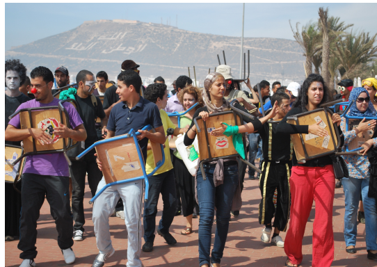
TC for students Agadir, Morocco 2011