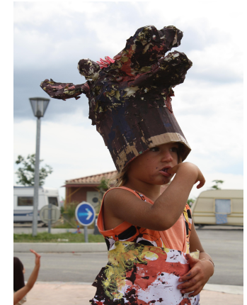
Workshop in gypsy camp 2010

http://www.socialandart.com/art-et-education.htm