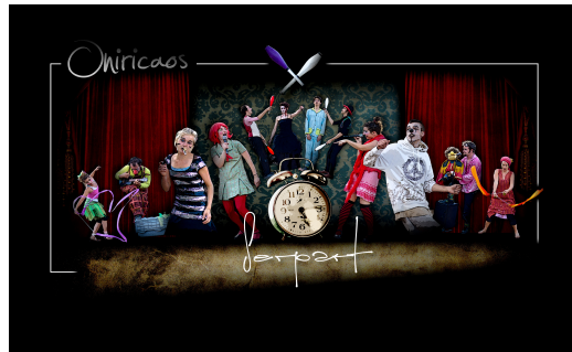
Onirichaos : 2010-2011