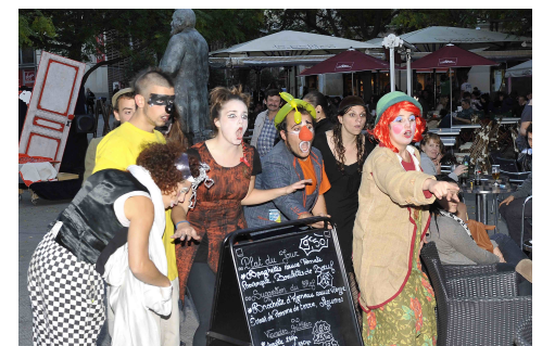
Improvisions : 2014

For Odyssea Rocks , we connected with 2 partners :