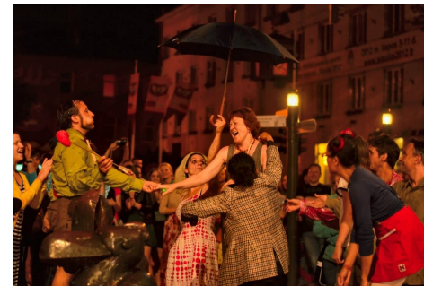
To Love or Not To love : 2012