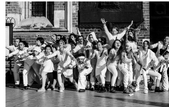
Migrart project, TC for artists, Poland 2018